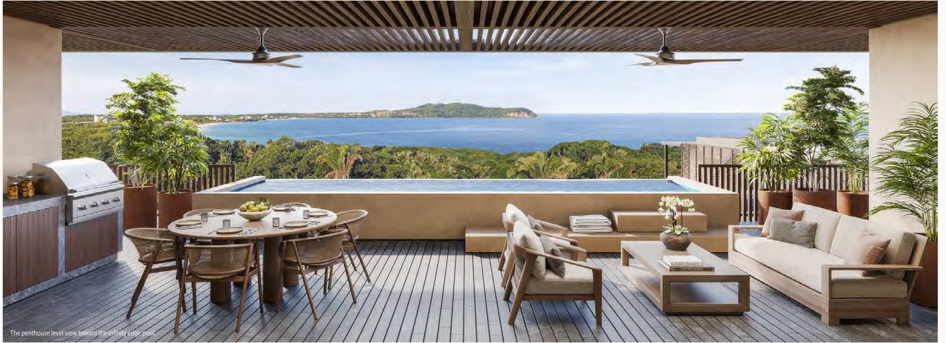
The penthouse level view toward the infinity edge pool.