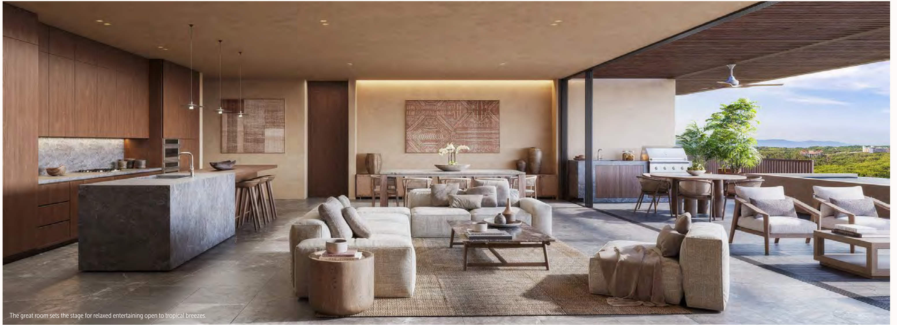
The great room sets the stage for relaxed entertaining open to tropical breezes.